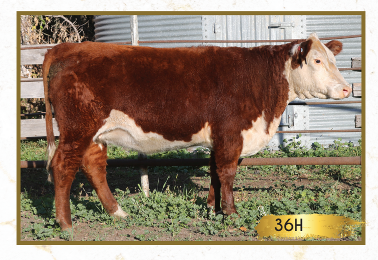
Service Sire- NIW 202C 81E Steward 98G ET